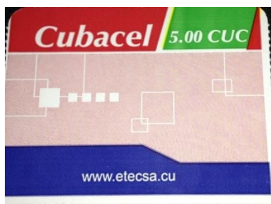
Sample Cubacel card

You may purchase credit (it will look like the card below) for your phone at any hotel, ETECSA or Cubacel.