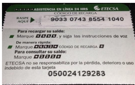
Back of Cubacel card

Every month Cubacel has an offer (usually announced by a SMS message to people's cell phones) in which during a three-day period customers are encouraged to purchase credit for their cell phones. During this period Cubacel will double the amount of credit that appears on the person's cell phone. For example if 20 CUC are paid toward your account during the days of the offer, 40 CUC will be credited. However, this offer is only valid if the payment is made from outside of Cuba. This means that your family, relatives or friends have to make the payment to your account from the US.